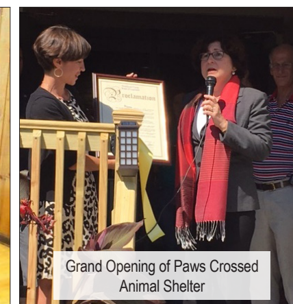
Grand Opening of Paws Crossed Animal Shelter