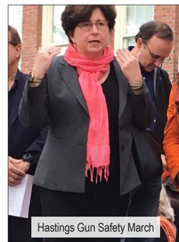
Hastings Gun Safety March