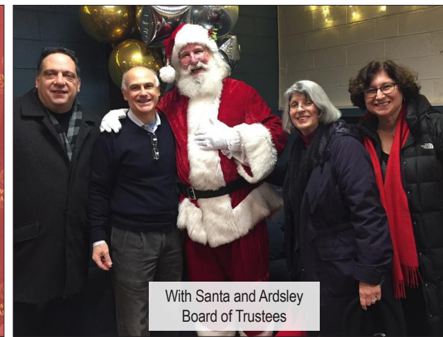
With Santa and Ardsley Board of Trustees