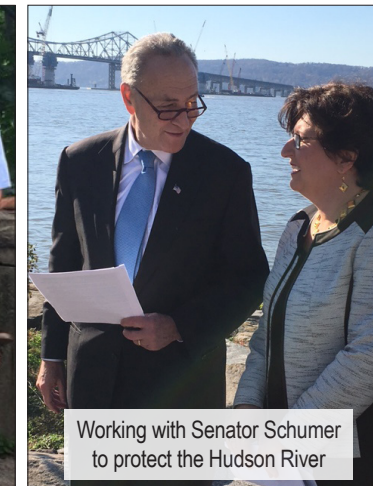
Working with Senator Schumer to protect the Hudson River