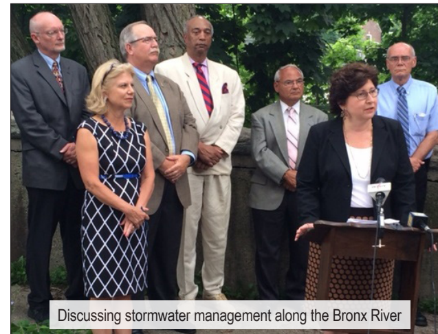
Discussing stormwater management along the Bronx River