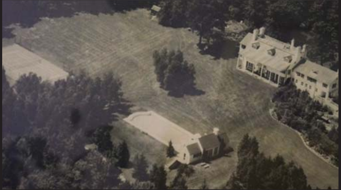
Lasdon estate, Somers