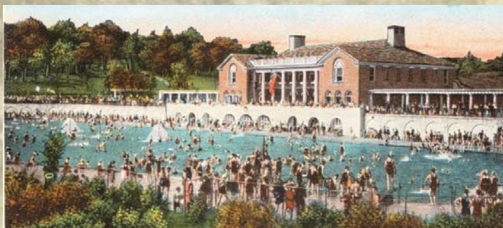
Tibbets Brook Park, Yonkers

In the early 1960s it became apparent to county officials that our forerunner organizations, the Westchester Parks Commission and Recreation Commission, had many common and interdependent goals - so they were merged, creating the Department of Parks, Recreation and Conservation.