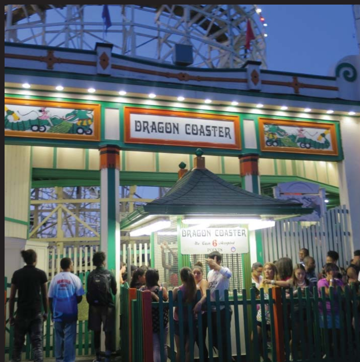
Playland Park, Rye

A review of historic Playland Park, which opened in 1928, has resulted in an investment to rebuild its infrastructure to keep the amusement park experience thriving for generations to come.