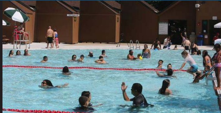
Sprain Ridge Pool, Yonkers

When trends suggested that pool users were looking for more splash-down, keep-cool, family-friendly fun in the water, we transformed two traditional rectangular pools into family aquatic centers while renewing the commitment to the traditional swimmer and need for competition space.