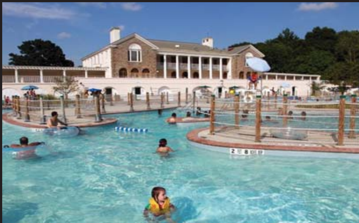
Tibbets Brook Park, Yonkers