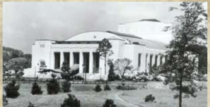
Westchester County Center, White Plains

Technology has been harnessed to allow the Westchester County Center, going strong as a civic center and show space since 1930, to evolve into a modern venue for sports, stage and concert performances and more.