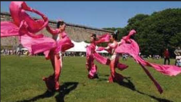
Kensico Dam Plaza today