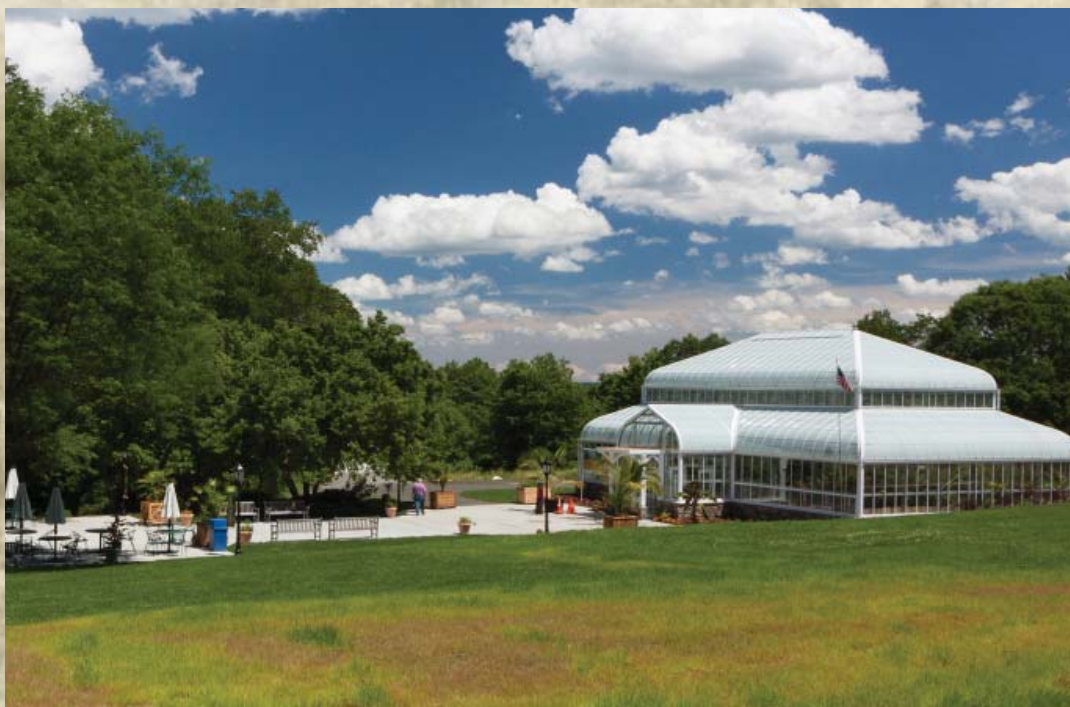
Lasdon Conservatory today