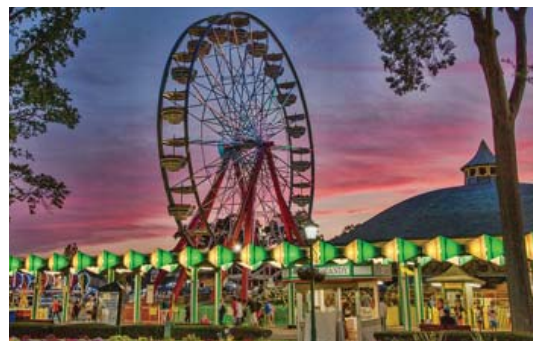
Playland Park at sunset, Rye

“Parks for Healthy Cities – Time to Fill Our Prescription.” The Huffington Post 20 April, 2016