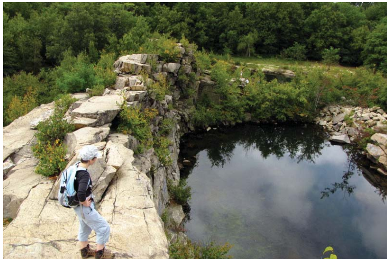
Hiking at Cranberry Lake Preserve – North White Plains