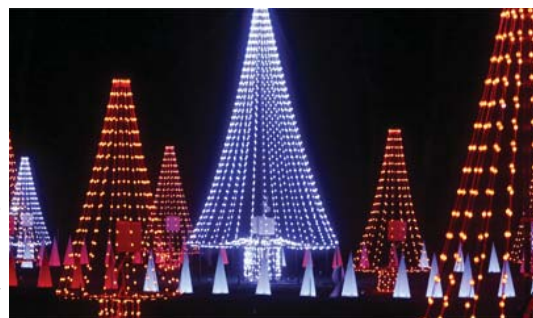
Westchester's Winter Wonderland, Kensico Dam Plaza, Valhalla

“Parks developed and managed by cities and counties ... offer the most widespread opportunities to enjoy recreation that can help address public health issues.”