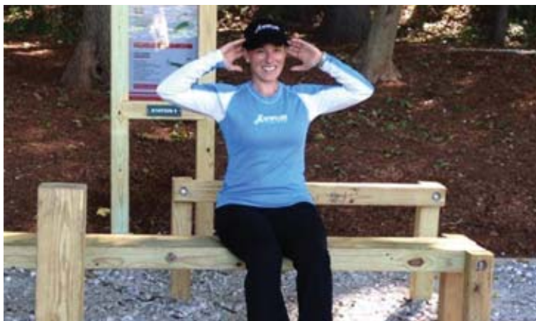
Fitness station at Kensico Dam Plaza, Valhalla

U.S. Surgeon General Vivek H. Murthy in National Park Service 2016 Park Rx press release