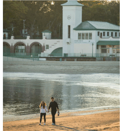
Beach at Rye Playland, Rye