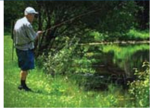
Lasdon Park and Arboretum, Somers