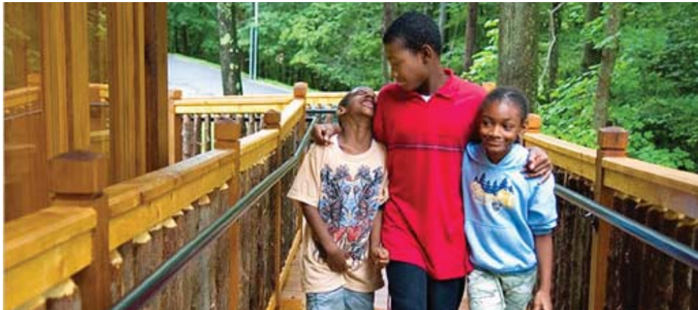
Young Farmers Program, Alfred B. DelBello Muscote Farm