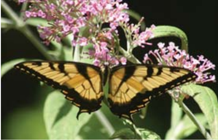
Croton Point Park, Croton-on-Hudson