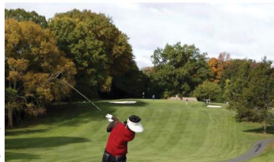
Dunwoodie Golf Course, Yonkers