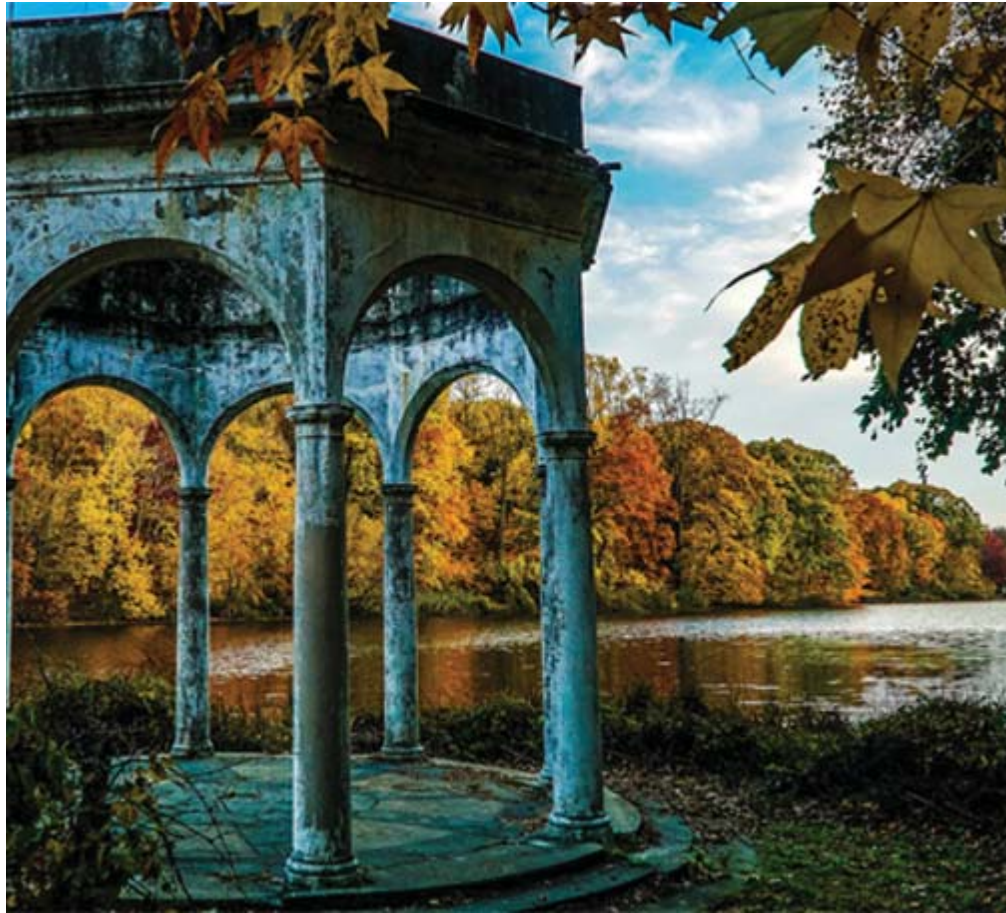
Tibbetts Brook Park, Yonkers