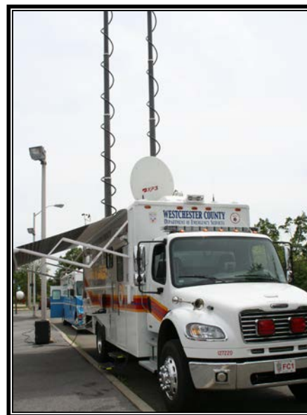
Figure 3: Field Communications Unit - FCU