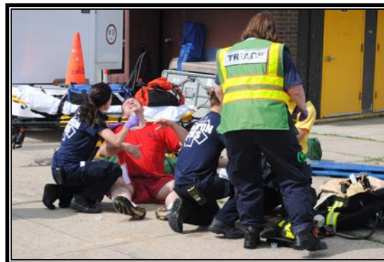
Figure 1: Hazardous Materials Exercise (June 2015)