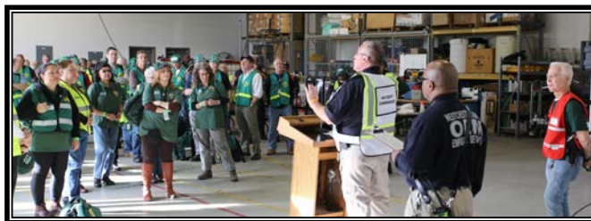
Figure 4: Westchester Citizen Corps Coalition Volunteer Responder Drill (September 2015)