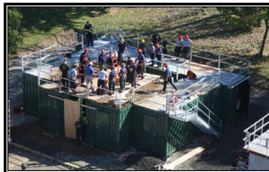
Figure 2: Trench, Confined Space and Collapse Rescue Training Prop (September 2015)