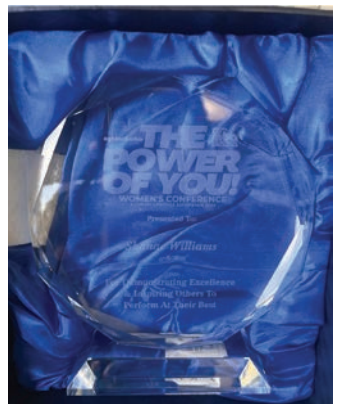
Pictured Left to Right: Business Council of Westchester 40 Under 40 Rising Stars 2024 Honoree; Total Faith Network 2024 Public Service Award; MetroNY NMBAA Power of You Conference 2024 Leadership Award