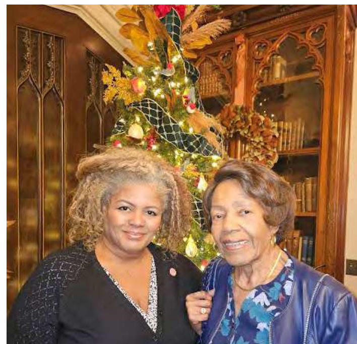
Mother & Daughter at Lyndhurst Mansion 2023 Holiday Decorations Tour