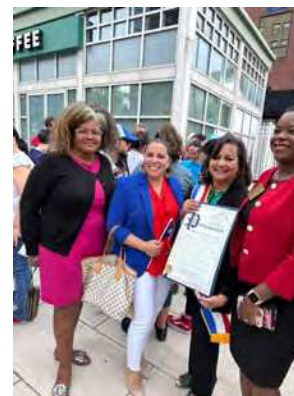
WP Puerto Rican Flag Raising