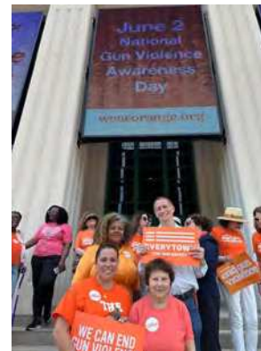
Moms Demand Action Wear Orange for Common Sense Gun Laws Event