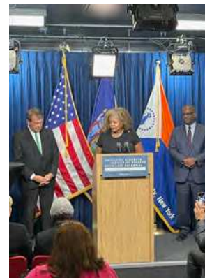
WC 2024 Budget Approval