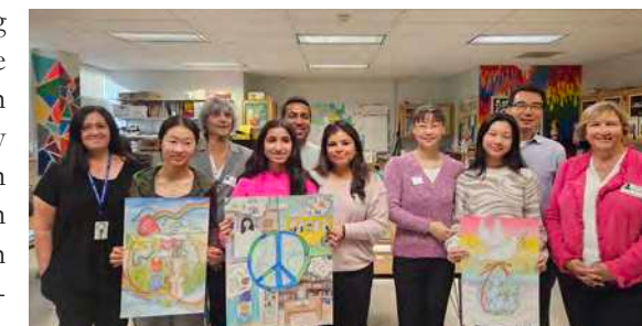
Lions Club Peace Poster Contest Winners at BBMS

I am incredibly proud of our young people and I continue to advocate for funds and programs to help them reach their full potential. I successfully advocated for funding for a new van for the Port Chester Youth Bureau. In the 2024 Budget, I allocated program funding to The Sharing Shelf and ACT-SO for the first time, allowing them to expand their efforts to help children and families within our district, and throughout the County. I also secured funding to bring the highly successful “Summer Reading Buddies” program to Port Chester. In addition, among many other worthy organizations, Carver Center and Latino U will continue to receive funding in 2024. ■