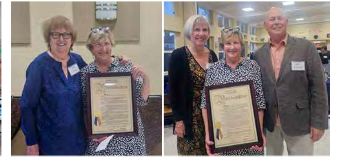
Community Council Honors Lifelong Volunteers