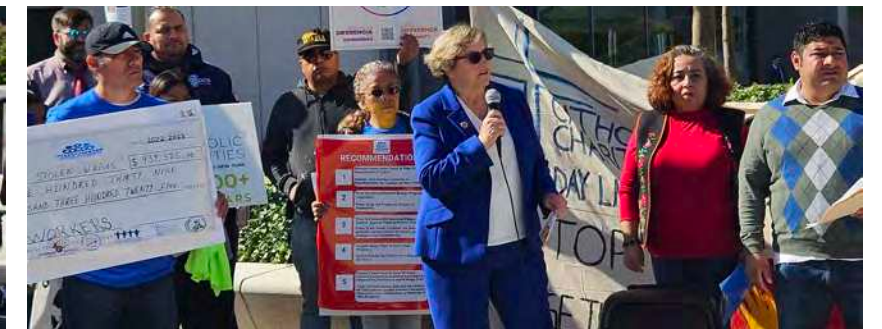
Rallying Against Wage Theft