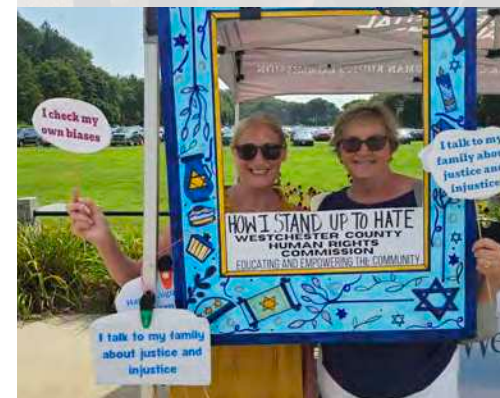
We Stand Against Hate