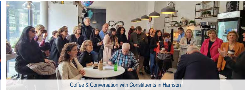
Coffee & Conversation with Constituents in Harrison