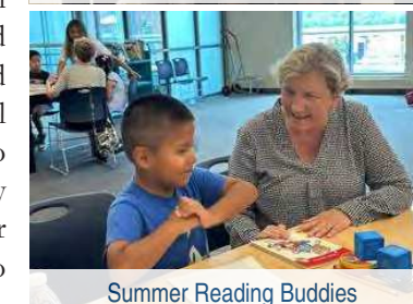
Summer Reading Buddies