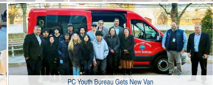
PC Youth Bureau Gets New Van