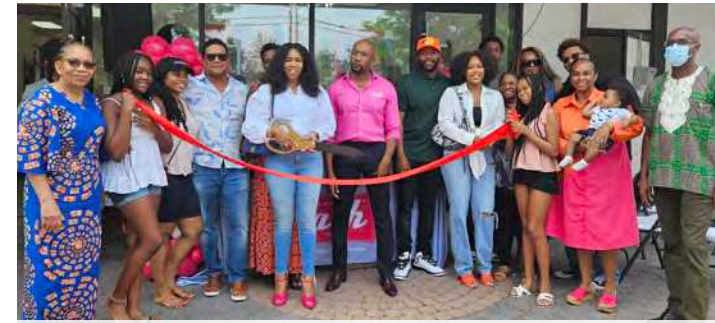
Welcoming New Business to Rye Brook