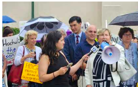
Save the Hudson River Rally