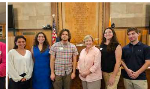
Hosting Summer Interns