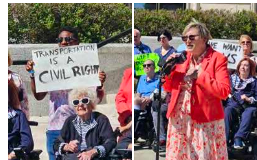
Fighting for Disability Rights