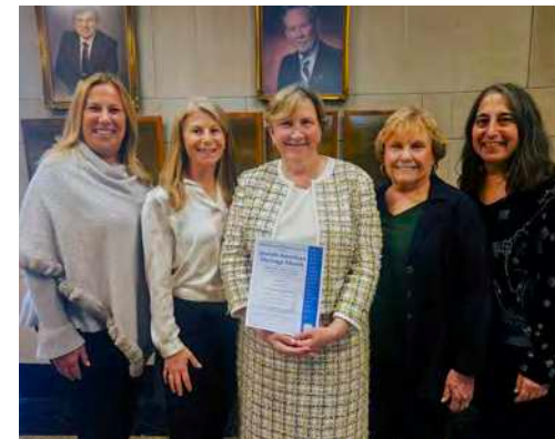
Volunteers for Refugees