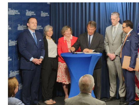
Hate Incidents Bill Signing

REPORTING OF HATE INCIDENTS: Statistics show hate incidents have been on the rise since the coronavirus pandemic started. The majority of these incidents go unaddressed by federal and state laws because they do not rise to the level of criminality. For this reason, the Board passed a law requiring local law enforcement to report all bias-related crimes and incidents. These incidents will be tracked by the Commissioner of Public Safety and the County's Human Rights Commission. ■