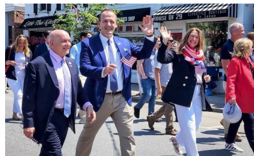
Chappaqua's Memorial Day Parade

We have continued our commitment towards our community college, making sure that is affordable for residents as well as continually being updated to provide students and staff with the latest technologies. This year alone we have replaced roofs on a number of buildings on the main campus. We have also continued with various infrastructure upgrades in Academic Arts, Science, and Maintenance Buildings, and updated the technology available on and off campus. Most importantly, we passed a budget in collaboration with SUNY WCCC that included a zero percent tuition increase. ■