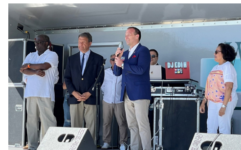
Speaking at the Albanian Heritage Celebration at Kensico Dam