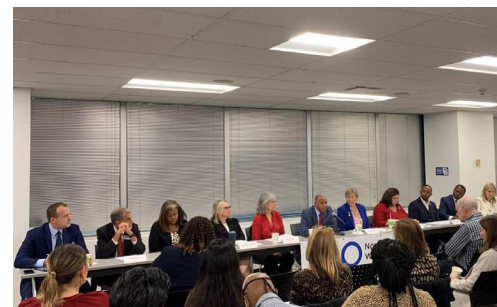
Non Profit Westchester Budget Forum