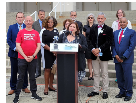
Firearms Warning Label Press Conference

FIREARM WARNING LABELS: I was also the lead sponsor of a firearm warning label law. This law will require gun stores to post signs warning those with access to firearms of the increased risks of suicide, homicide, death during domestic disputes, and the accidental deaths of children or others.