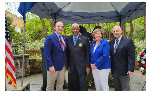
County Memorial Day Ceremony at Lasdon Park