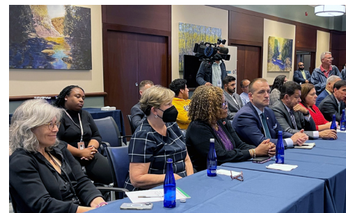
Attending a roundtable with the Attorney General about public safety