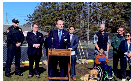
Groundbreaking at Granite Knolls Playground, an inclusive/accessible playground in Yorktown