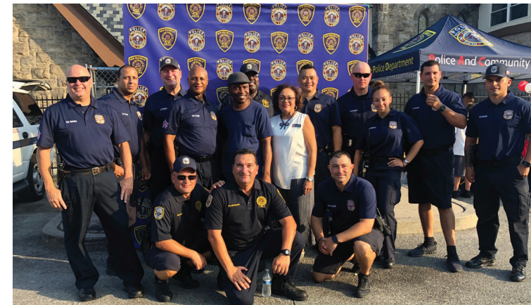
New Rochelle Police Department National Night Out

By making sure that more, and more affordable rental housing stock remains on the market, these laws will not only protect renters in stabilized units, but should also help keep rents more affordable across the board in Westchester County and the entire region. ■