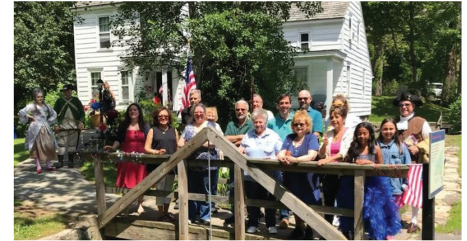
THOMAS PAINE COTTAGE REOPENING — It was an honor to join the Huguenot & New Rochelle Historical Association this June for the re-opening of the Thomas Paine Cottage Museum. Knowing our history helps shape our future. The Thomas Paine Cottage is a New Rochelle gem. Thank you to the director, staff and board for keeping our history alive.