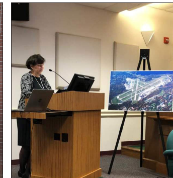
Advocating for residents' concerns at the first of three airport public hearings