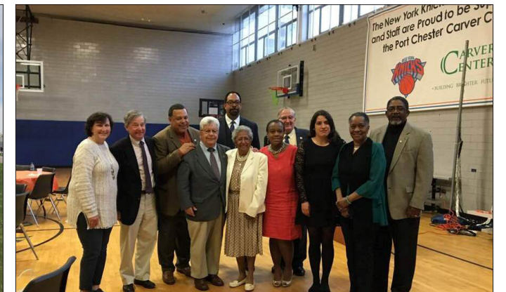
Celebrating with local officials at the NAACP Effie Gordon Tea