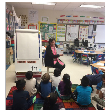
Reading to students at Thomas A. Edison elementary school in Port Chester