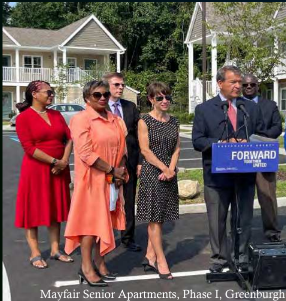
Mayfair Senior Apartments, Phase I, Greenburgh