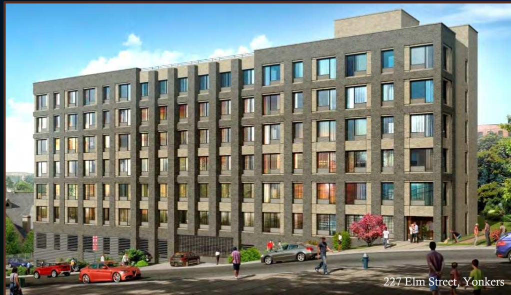
227 Elm Street, Yonkers