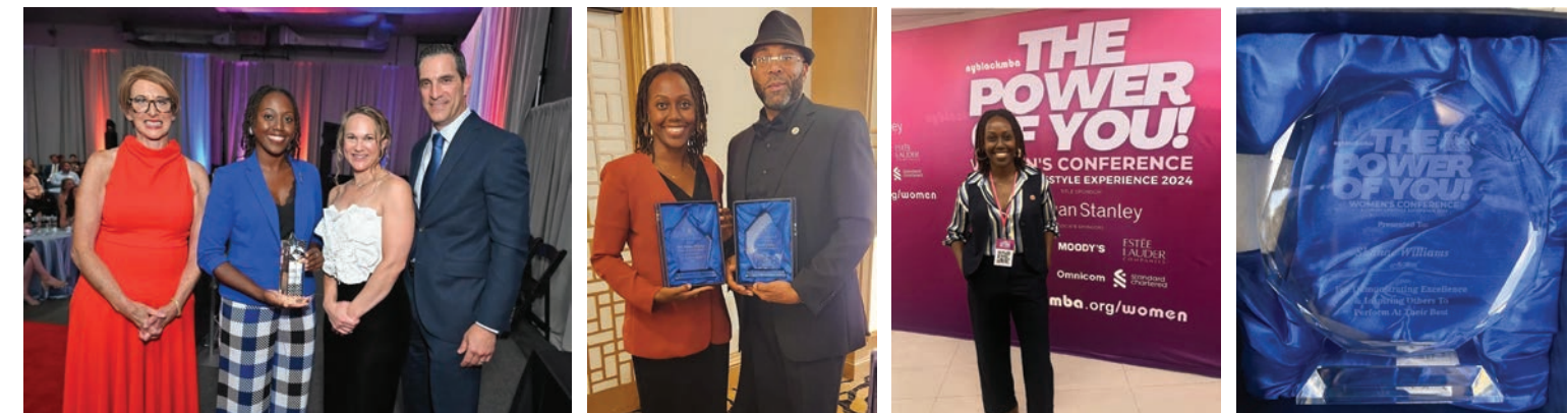
Pictured Left to Right: Business Council of Westchester 40 Under 40 Rising Stars 2024 Honoree; Total Faith Network 2024 Public Service Award; MetroNY NBMBA Power of You Conference 2024 Leadership Award

Let's make the 2025 event an even greater success!