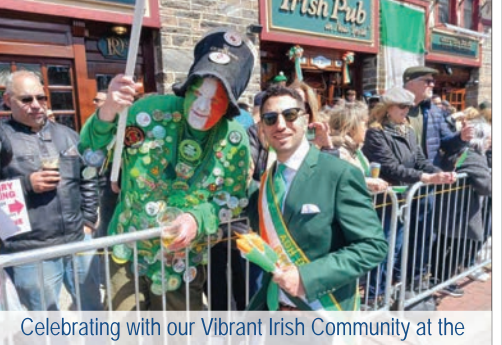
2024 Yonkers St. Patrick's Day Parade