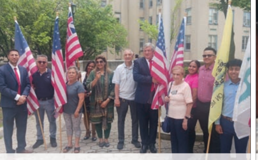
Celebrating Flag Day 2024 at Yonkers City Hall