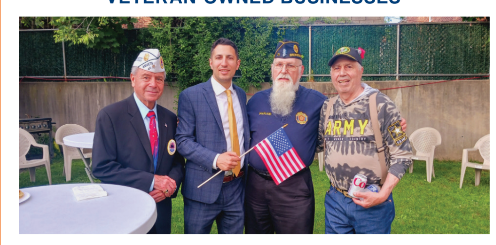
Standing Proudly with Our Veterans on Memorial Day at the Charles N. Bajart Post on McLean Avenue

I was deeply proud and honored to support legislation aimed at empowering certified disabled veteran-owned businesses by encouraging their active participation in the County's contracting process. This initiative not only recognizes their invaluable contributions but also strengthens our community by fostering inclusivity and opportunity.