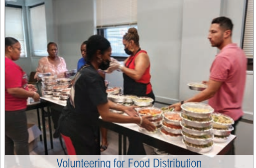
at Palisade Towers in Yonkers