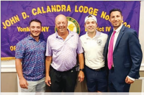
Sons of Italy 2024 Charity Golf Outing