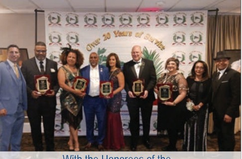
With the Honorees of the 2024 Dominican Cultural Association of Yonkers Gala