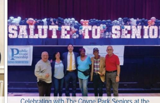
Celebrating with The Coyne Park Seniors at the 2024 Salute to Seniors Expo