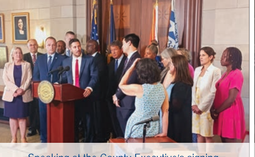
Speaking at the County Executive's signing of the Domestic Violence Locks Law