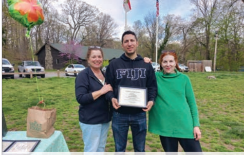
Being Honored by 'Friends of Scout Field'