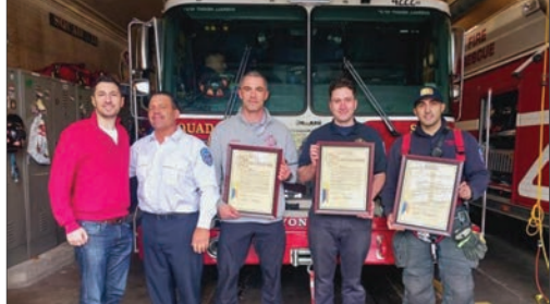
Honoring the bravery of Yonkers Fire Station 11 for rescuing a stranded motorist during a Bronx River Parkway flood