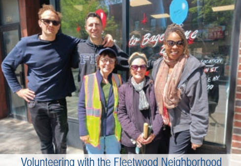
Volunteering with the Fleetwood Neighborhood Association at their 2024 Flower Planting event