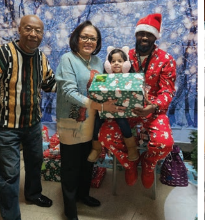
Giving out gifts at the Boys and Girls Club