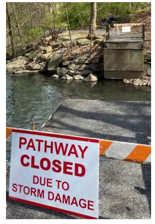
UPDATE: The Bronxville Footbridge is expected to finish construction during the Fall. The Contractor has had supply chain issues getting some of the necessary parts. The bridge is being built offsite.

Heeding the calls of eager residents wanting to take advantage of the County's award-winning parks system, the County announced the full replacement of the Bronxville pedestrian footbridge on the Bronx River Pathway off Pondfield Road. The footbridge was destroyed during the remnants of Hurricane Ida, which passed through Westchester County last year. The bridge's abutments, borings, and deck were washed away during last year's flooding and will need complete replacement. This park's infrastructure upgrade also comes at my behest, who, like the County, heard from residents about the need to repair the footbridge. When my office received numerous correspondence on this issue, I knew we had a partner in the County Executive who was just a phone call away. The use of the County's extensive trail network is vital to the recreation residents enjoy, and I am eager to see this project commence.