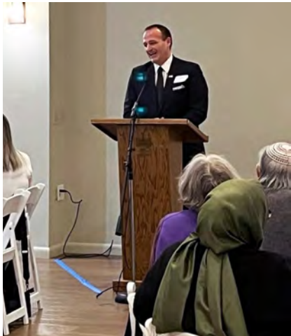
reaking the Fast with Westchester Jewish Counci