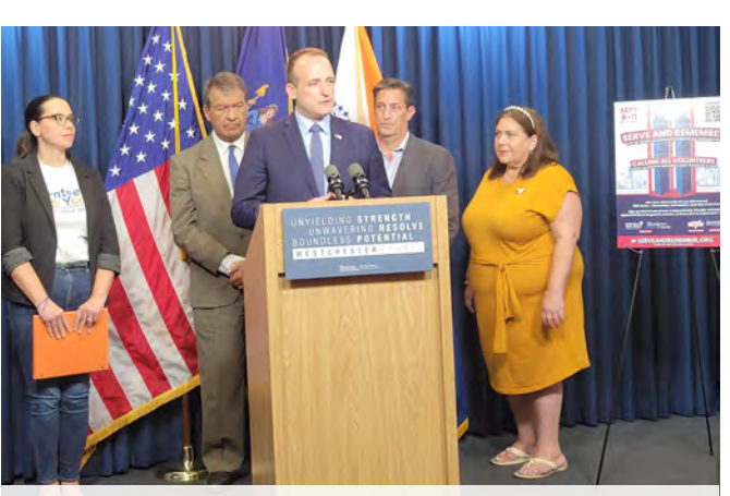
Serve & Remember 9/11 Opportunities with Volunteer NY