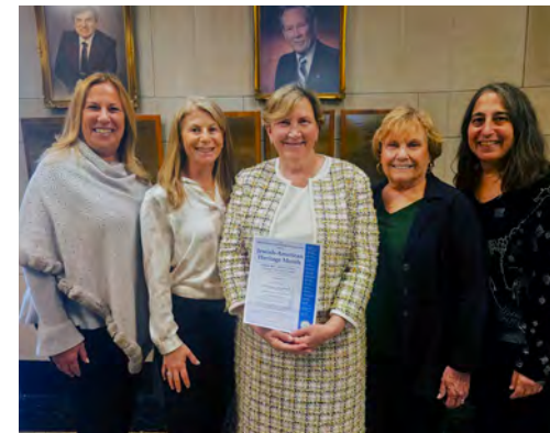
Volunteers for Refugees