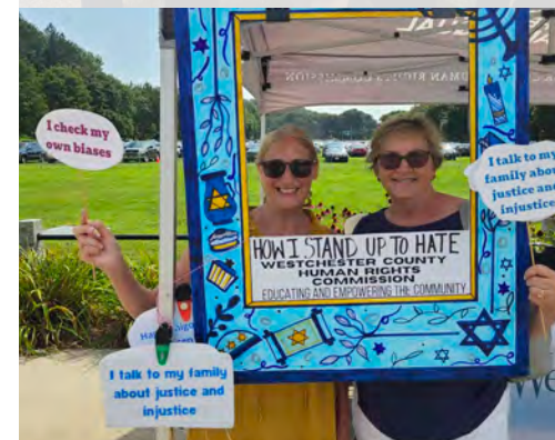
We Stand Against Hate