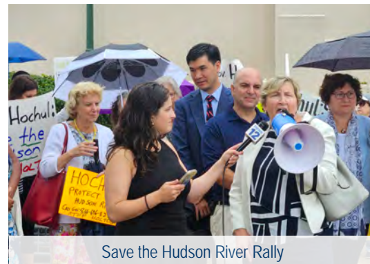
Save the Hudson River Rally