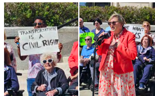
Fighting for Disability Rights