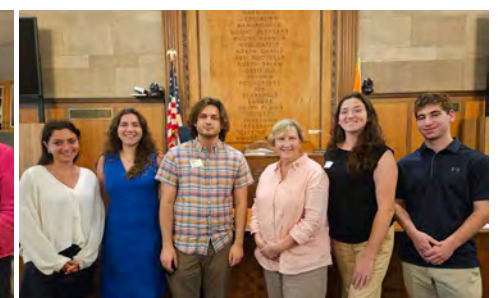
Hosting Summer Interns