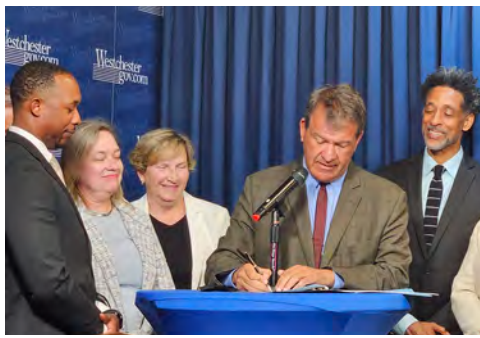
Signing Access to Counsel Bill