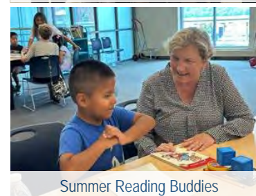
Summer Reading Buddies