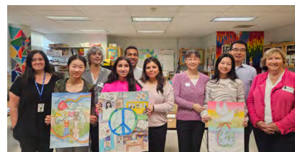
Lions Club Peace Poster Contest Winners at BBMS

I am incredibly proud of our young people and I continue to advocate for funds and programs to help them reach their full potential. I successfully advocated for funding for a new van for the Port Chester Youth Bureau. In the 2024 Budget, I allocated program funding to The Sharing Shelf and ACT-SO for the first time, allowing them to expand their efforts to help children and families within our district, and throughout the County. I also secured funding to bring the highly successful “Summer Reading Buddies” program to Port Chester. In addition, among many other worthy organizations, Carver Center and Latino U will continue to receive funding in 2024. ■