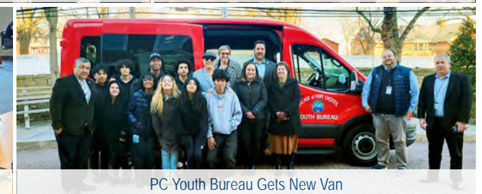
PC Youth Bureau Gets New Van