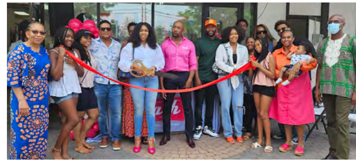
Welcoming New Business to Rye Brook