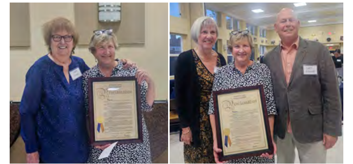
Community Council Honors Lifelong Volunteers