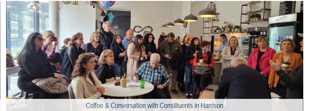
Coffee & Conversation with Constituents in Harrison