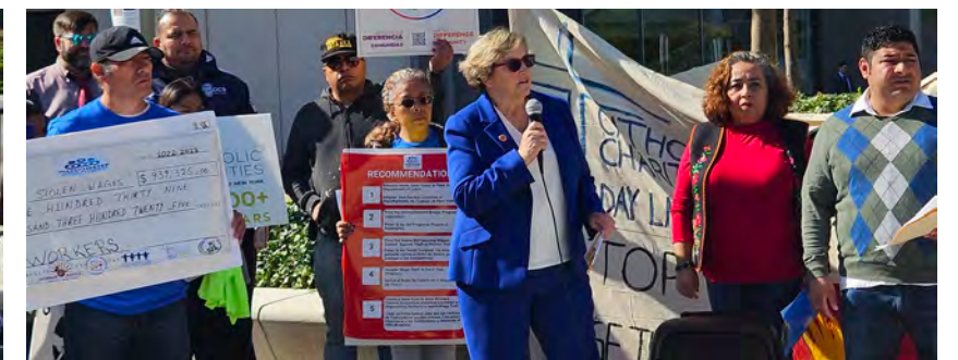
Rallying Against Wage Theft