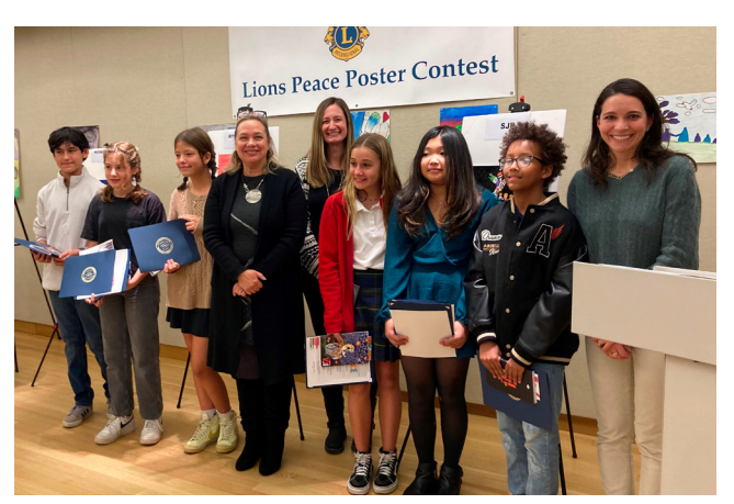
With winners of the Lions Club Peace Poster Contest