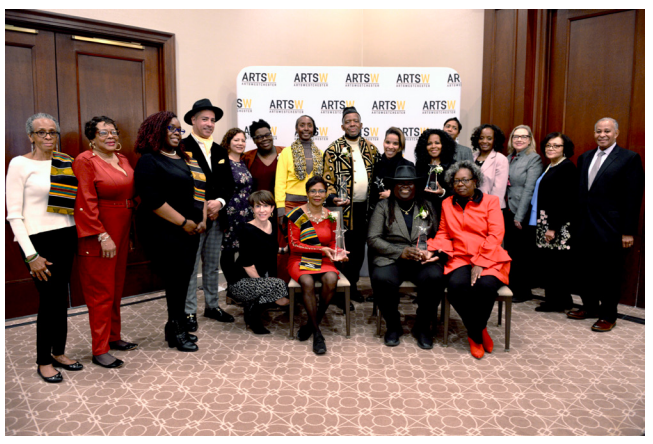
Celebrating ArtsWestchester Juneteenth Grantees