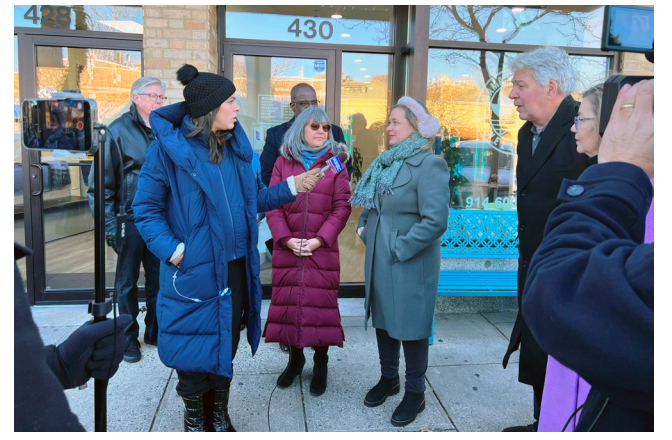
Highlighting the importance of shopping local during the holiday season on Mamaroneck Ave. with County and Local Officials