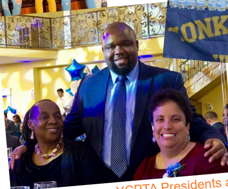
Spotted 2 Former YCPTA Presidents at My Brothers Keeper Event in Yonkers