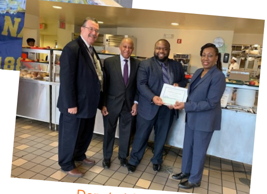
Donated $1,300 to Yonkers' Soup Kitchen