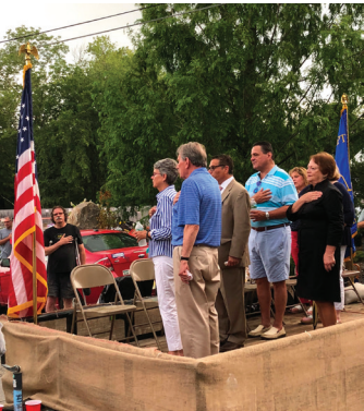
Lewisboro Fire Department Annual Parade