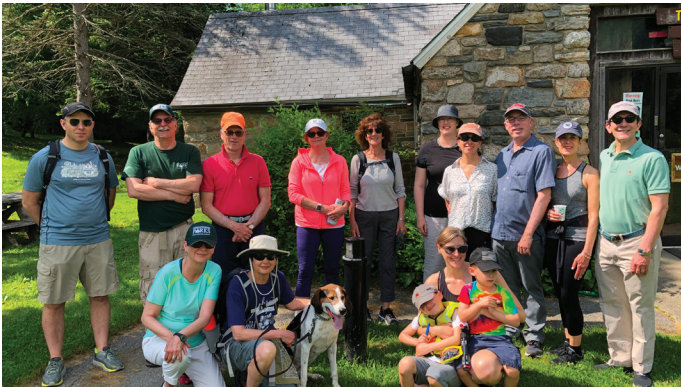
Get to Know Your County Parks with your County Legislator at Ward Pound Ridge Reservation

We have so much going on in our towns: Food Truck Fridays in Pound Ridge; an expanded September Fest in Mt Kisco; a brand new Tri-Festa in Bedford; Lewisboro’s biathlon on Labor Day; celebrating Somers day in September; a horse show in North Salem; spending time in any of our five County Parks or our arts institutions and farmers markets. We are lucky to live here in District Two.