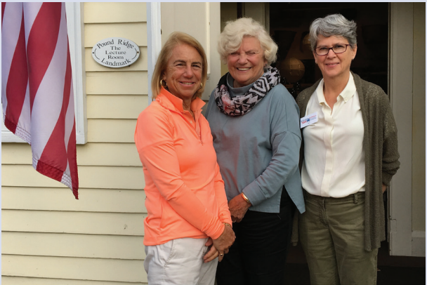
Pound Ridge Historical Society

Without having roads, electricity and water in good repair, our communities cannot function. I have worked hard to make certain that stalled infrastructure projects in North Salem and Pound Ridge move forward. Long Ridge Road is now slated to receive $1.25 million in repaving work. New school bus stop signs have been installed on county roads in Bedford, and I have worked to ensure that local municipalities are reimbursed for plowing and repair of local county roads. We have established a 684 working group that includes all of your state and local elected representatives to find a short term solution while being cognizant that a new design will ultimately be the permanent solution. For our utilities, we have had many meetings regarding storm and other outages, and have sent letters and resolutions to both utility companies about areas in which they need to make improvement. I also met one-on-one with the CEO/President of NYSEG to discuss these issues. I am happy to report that we are beginning to see improvements, including some accelerated tree trimming, smart meter investments and improved NYSEG/community support during storms. As our district is a critical part of the watershed, I was able to deliver $750,000 back to our district to help pay for the operation and maintenance of the watershed systems.