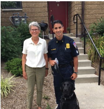
Meeting Mt Kisco residents with the County Police at Mt Kisco Night Out