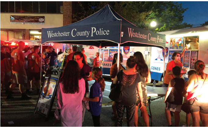
Cops and Cones in Mount Kisco