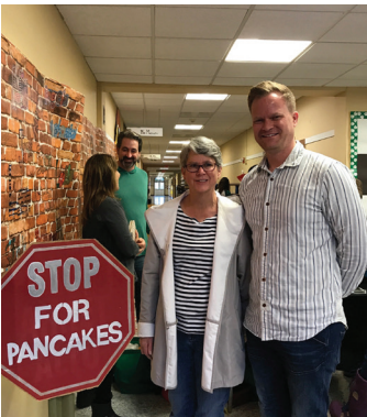
Pancakes at Pound Ridge Elementary