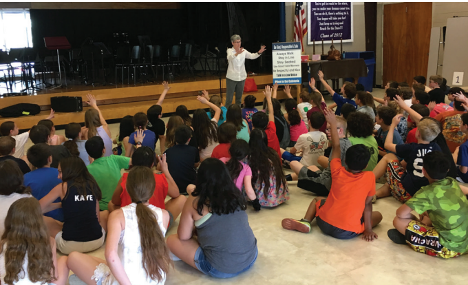
Talking with fifth grade students at Increase Miller Elementary School