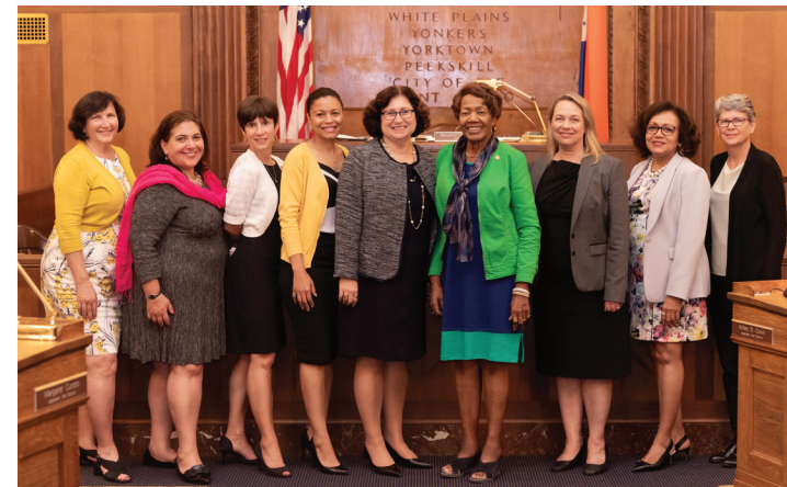
A record number of women serving at the Westchester Board of Legislators

I send out informative emails including everything from lists of events around our district, to information about what is happening at the county including pending legislation, critical health related issues, and opportunities for our community members, along with