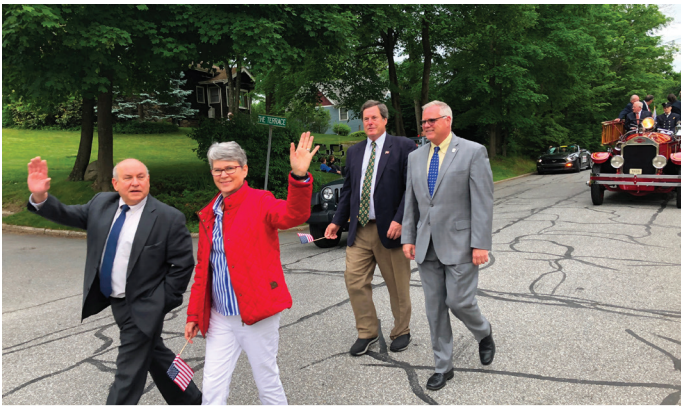
Katonah Fire Department Annual Parade