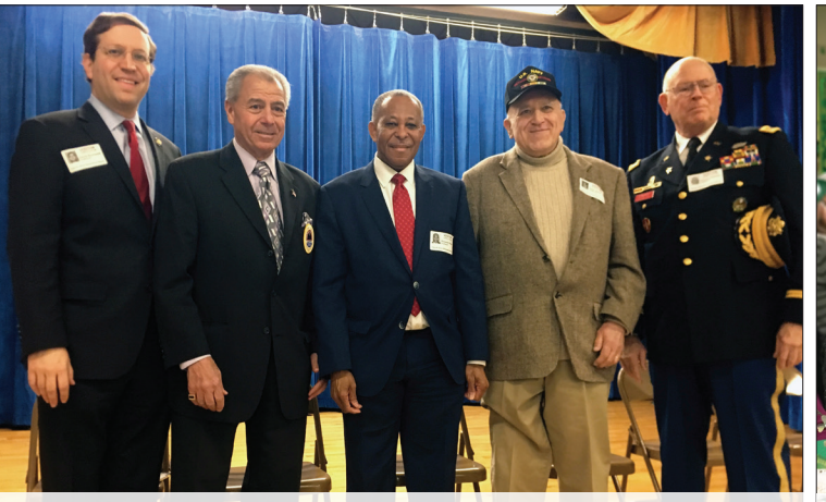
Valentines for Vets at Church Street School