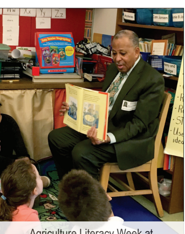
Agriculture Literacy Week at Mamaroneck Ave. Elementary School