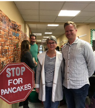
Pancakes at Pound Ridge Elementary