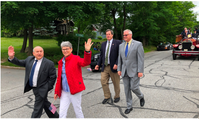
Katonah Fire Department Annual Parade