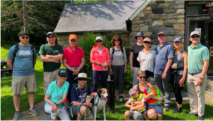
Get to Know Your County Parks with your County Legislator at Ward Pound Ridge Reservation

We have so much going on in our towns: Food Truck Fridays in Pound Ridge; an expanded September Fest in Mt Kisco; a brand new Tri-Festa in Bedford; Lewisboro’s biathlon on Labor Day; celebrating Somers day in September; a horse show in North Salem; spending time in any of our five County Parks or our arts institutions and farmers markets. We are lucky to live here in District Two.