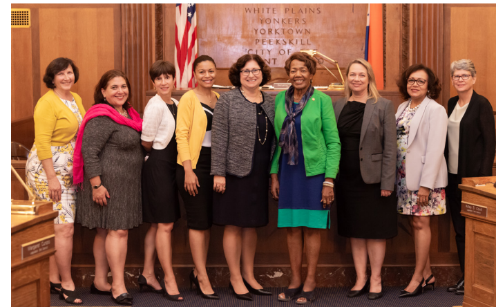
A record number of women serving at the Westchester Board of Legislators

I send out informative emails including everything from lists of events around our district, to information about what is happening at the county including pending legislation, critical health related issues, and opportunities for our community members, along with