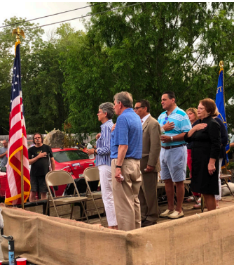
Lewisboro Fire Department Annual Parade