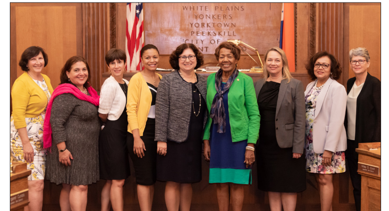
Making HERstory-- a record number of women now serve on the Westchester Board of Legislators

My colleagues and I passed several laws to improve the lives of Westchester residents. These include prohibiting gun shows on county-owned property, raising the age to purchase tobacco and vaping products from 18 to 21, encouraging the hiring of service-disabled veterans in county contracts, banning the practice of "conversion therapy" for minors, and the Immigrant Protection Act. Some of these initiatives had been stalled for years, but 2018 brought many new legislators to county government -- including a history-making majority of women -- and we are working together for the benefit of all Westchester residents.