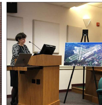
Advocating for residents' concerns at the first of three airport public hearings