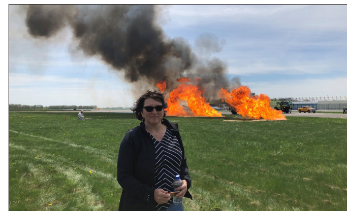
Onsite at a controlled fire during an airport safety drill