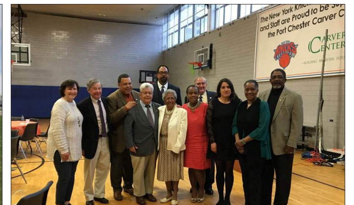
Celebrating with local officials at the NAACP Effie Gordon Tea