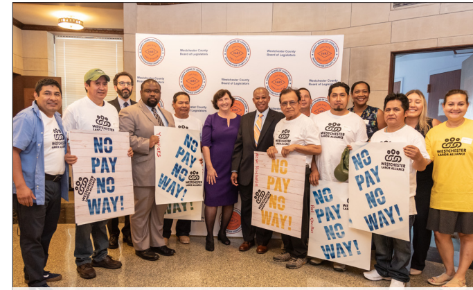
Introducing legislation to fight wage theft