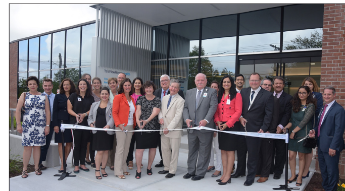
Ribbon-cutting to welcome the new medical multi-specialty center in Rye Brook