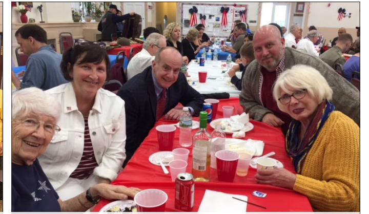
Enjoying lunch with Harrison seniors following the Memorial Day Parade