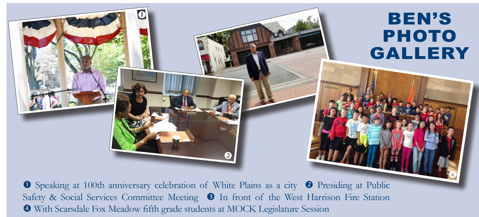
① Speaking at 100th anniversary celebration of White Plains as a city ② Presiding at Public Safety & Social Services Committee Meeting ③ In front of the West Harrison Fire Station ④ With Scarsdale Fox Meadow fifth grade students at MOCK Legislature Session

As a co-sponsor of this law first introduced in 2014, I am very happy that it was unanimously approved by the Board of Legislators in June 2016. The banning of the use of heavy, dirty No. 4 and No. 6 heating oils will improve our environment by eliminating a mixture of pollutants which these oils release into the air. These toxic chemicals are proven carcinogens and respiratory irritants. Phasing out these heating oils will provide improved health and cost savings to county residents. The ban on use of these heating oils will be effective July 31, 2018 for No. 6 and July 31, 2020 for No. 4. ■