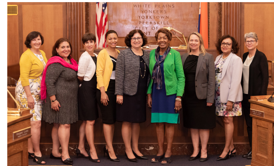
For the first time in its history, the Board of Legislators is a female-majority body